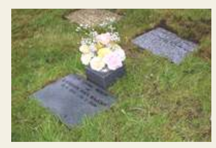
Cremation Tablets in a Churchyard

We have our own Memorial Masonry Department and if desired we will be pleased to discuss your requirements subject to any cemetery or churchyard regulations. Please contact the office if you would like to receive our memorial brochure.